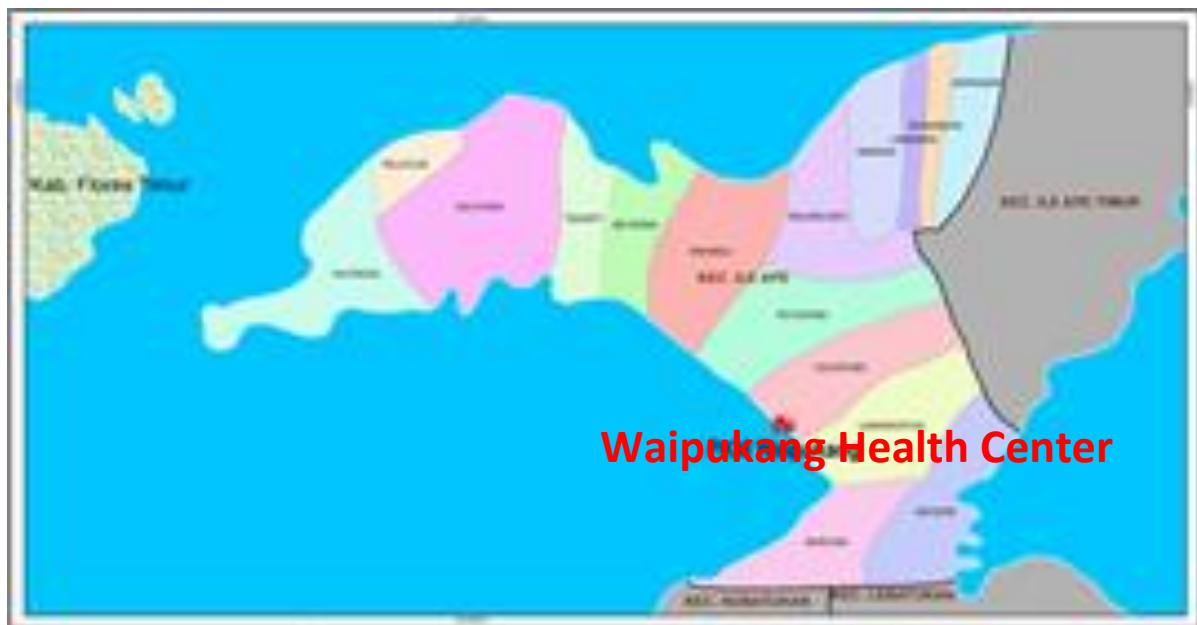
Figure 1. Waipukang Public Health Center areas

This research was conducted in malaria endemic area of Waipukang Public Health Center, Lembata, East Nusa Tenggara.